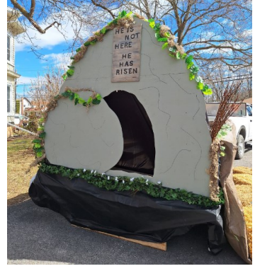
The empty Tomb—He is Risen!

To those who helped to build, those who served and those who helped behind the scene— thank you one and all! We couldn't have shared this life changing message with our community without you.